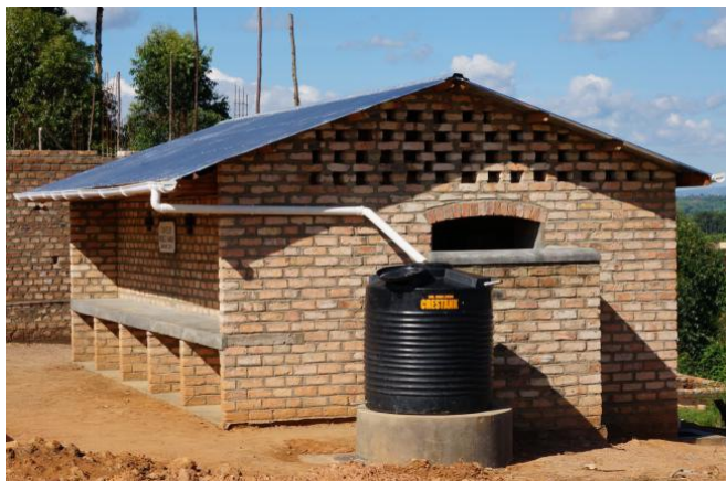
Project Uganda washroom at Buyanja Grammar School

The project will provide a permanent, purpose-built washroom with at least 20 individual cubicles. It will also include a rainwater harvesting system, which channels rainwater from the roofs of the school buildings into water tanks, so that the students can easily access water for drinking, bathing and washing clothes. There will also be an appropriate drainage system and soakaway enabling easy maintenance of the washroom.