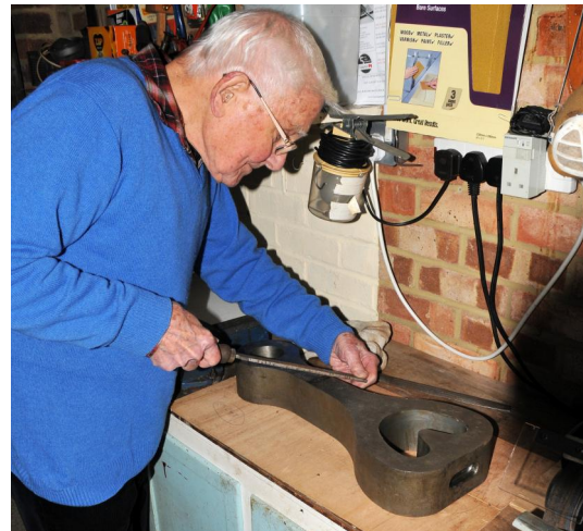
Putting radii on the link edges

Steady progress is being made with components for the Hind Pony Truck. Derek continues with machining the frame casting. The modifications to the pattern for the cradle were completed by Roy and the pattern taken up to Furniss & White for inspection prior to moulding. The casting is expected shortly.