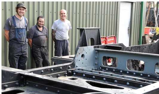
Completed riveting below the cab.

This was followed by the completion of the riveting to the frame stretchers in the area below the cab.