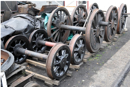
The wheel sets safely off the ground

Our present efforts are focussed on getting the loco' onto its coupled wheels. All the wheel sets are seen uncovered in the image below following their safe removal onto custom made timbers and set to minimise trapped water. They are being painted progressively.