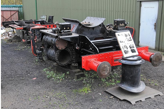
Frames and chimney ready for Giants of Steam weekend

This is the twentieth issue of our newsletter for supporters of the project.