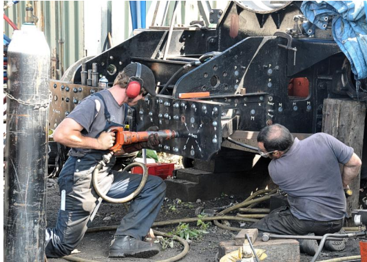
Closing rivets at the rear of the Front Drag-box

A pattern is being made for the Truck Bearing Spring Yoke bearing pad in readiness for fabricating the two new yokes we need.