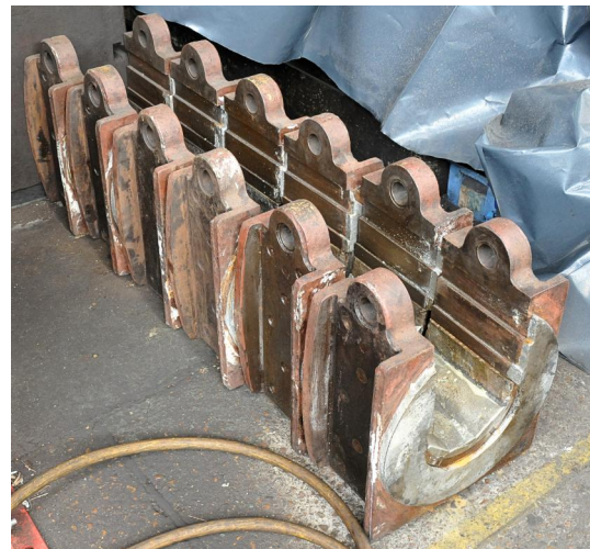
All six Axleboxes ready for machining

Steady progress is being made with components for the Hind Pony Truck. Derek continues with machining the frame casting. The modifications to the pattern for the cradle were completed by Roy and the pattern taken up to Furniss & White for inspection prior to moulding. The casting is expected shortly.